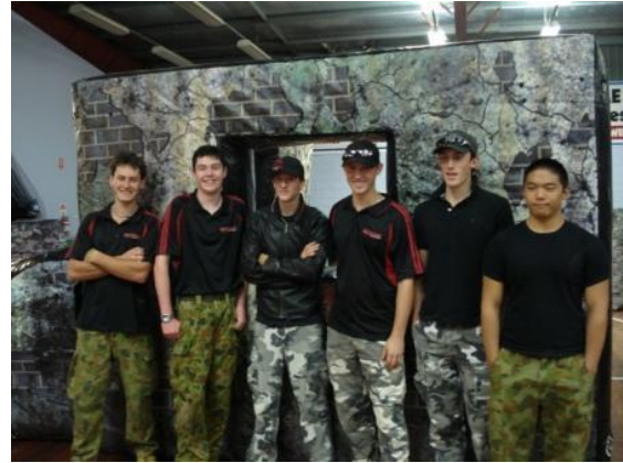
Team Flying Circus from NSW