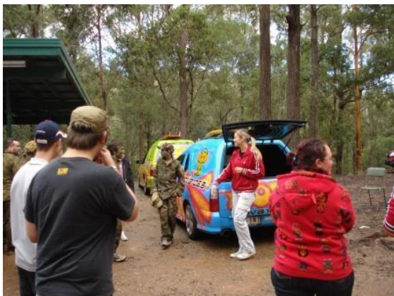
Homeboys undertaking press duties again... Fame comes with a cost.