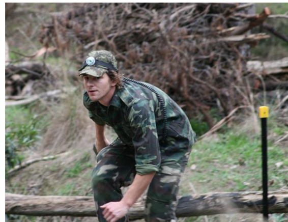
Big Ears listens for the enemy