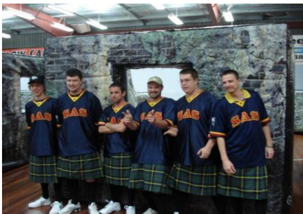
Clan SAS from South Australia...