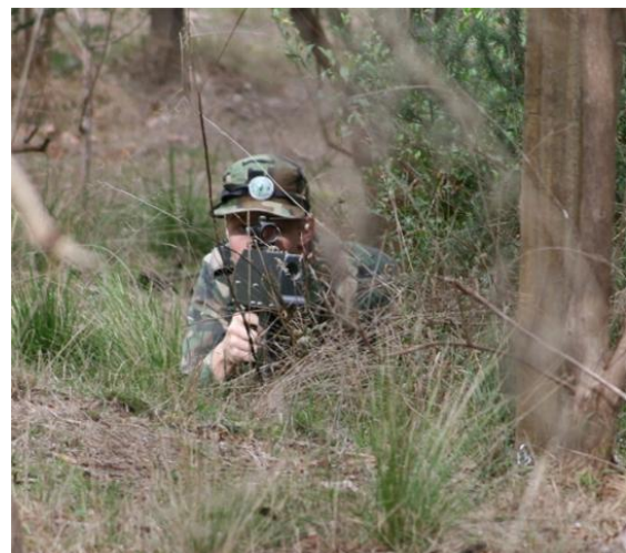
Wacko Jacko waits for the enemy