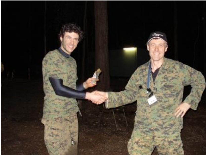
Plan hands over the cash to victorious Captain Blackhawk