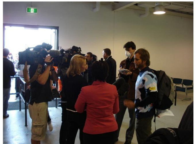
Dawg holds his pre-tournament press conference