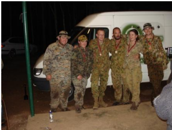
Team Bad Company from Queensland celebrate their 3rd place in the forest field