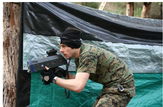
Blackhawk in training